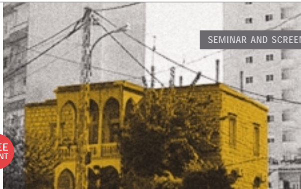
BEIRUT. 2006