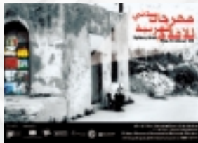
LAUNCH OF THE 2005 SYDNEY ARAB FILM FESTIVAL

In 2005, the second Sydney Arab Film Festival enabled 48 local and internationally-produced films to be screened across Campbelltown, Parramatta and Bankstown. Highlights included Egyptian classics from 1947 to 1971, the Australian premiere of Youssef Chahine's Alexandria New York , the epic The Door to the Sun spanning 50 years in Palestine, and student films from ALBA Fine Arts Academy, Lebanon. The Festival continues to be incubated and overseen by ICE.